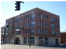
2401 W. Taylor

2 Bedroom/2 Bathroom in elevator building. Includes all stainless steel appliances, in-unit laundry, marble, granite, hardwood floors, parking space, huge closets, central air/heat.